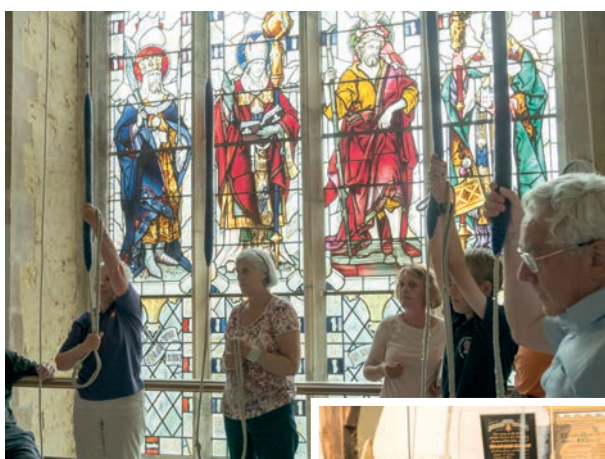
Blofeld stained glass