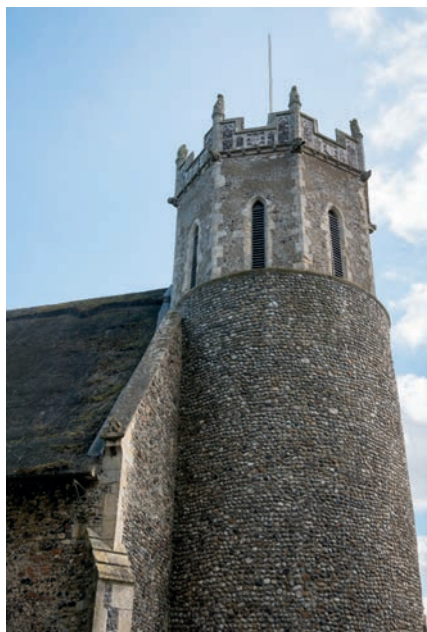
Acle - left, round tower; below, thatched roof; right, girders in ringing room

We then moved on to the 6-bell tower at Acle, a beautiful church with a thatched roof and a round tower. It is a ground floor ring and above our heads was a complex arrangement of steel girders, and when ringing it sounded like a group of people in clogs dancing on the ceiling! I found it quite hard to hear the bells when I was ringing, but from outside they sounded lovely.