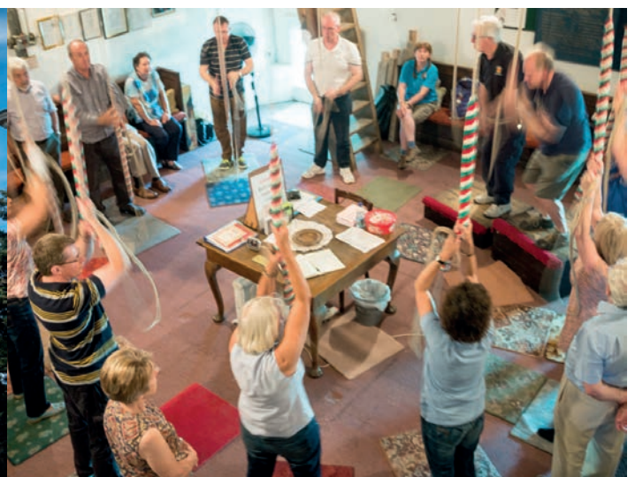
Great Yarmouth ringing