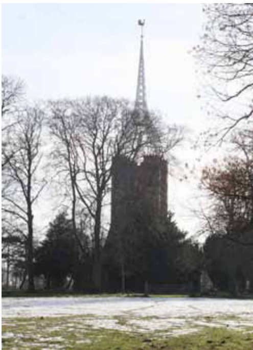
Waterloo tower of Quex Park near Birchington

Onward then to the much-awaited Waterloo tower of Quex Park near Birchington. A ring of 12 hung in a detached tower in the middle of a private estate. In the middle of a field in the middle of a private estate to be precise, and those who changed into wellies rejoiced at having dry feet, but at the same time losing all feeling in the cold, unheated tower. At least it had a door. The ropes all hung close to the walls, and unusually the largest box belonged to the treble rather than the tenor.