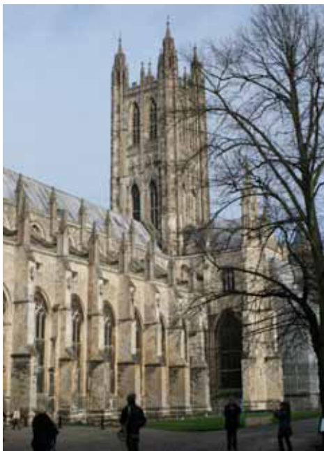
Canterbury Cathedral in watery winter sunshine – cold but bright.

While some stayed to enjoy the choir of St Stephen's church and a splendid organ piece with Westminster chimes (did they know we were there?) some eager amongst us made their way across the city to St Dunstan for some mental relief on 6 bells.