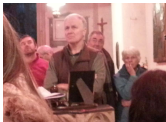
Anxious ringers wait their turn