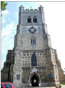
The Abbey Church of Holy Cross & St Lawrence, Waltham Abbey

The third and final Journey Stop that EACR is involved with took place this weekend, and was planned to coincide with the Waltham Abbey Town Show. The Show is an annual two day event, but we decided to just focus on the Sunday. As with the Saffron Walden event, there were other things going on ringing-wise within the Parish which made this a particular challenge.