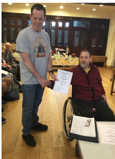
2 nd Waltham Abbey