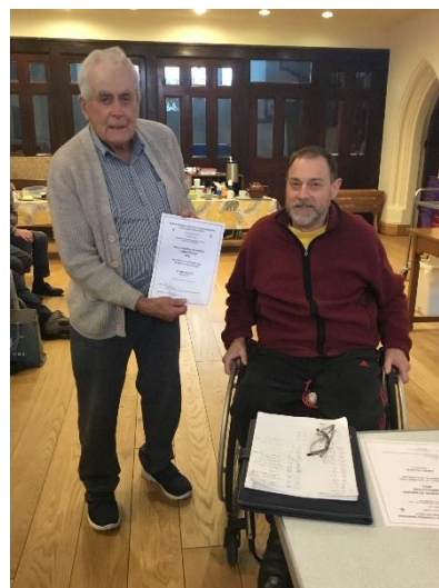
3 rd Epping Upland/Nazeing