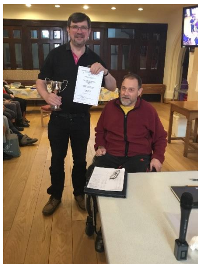
1 st Bishop's Stortford